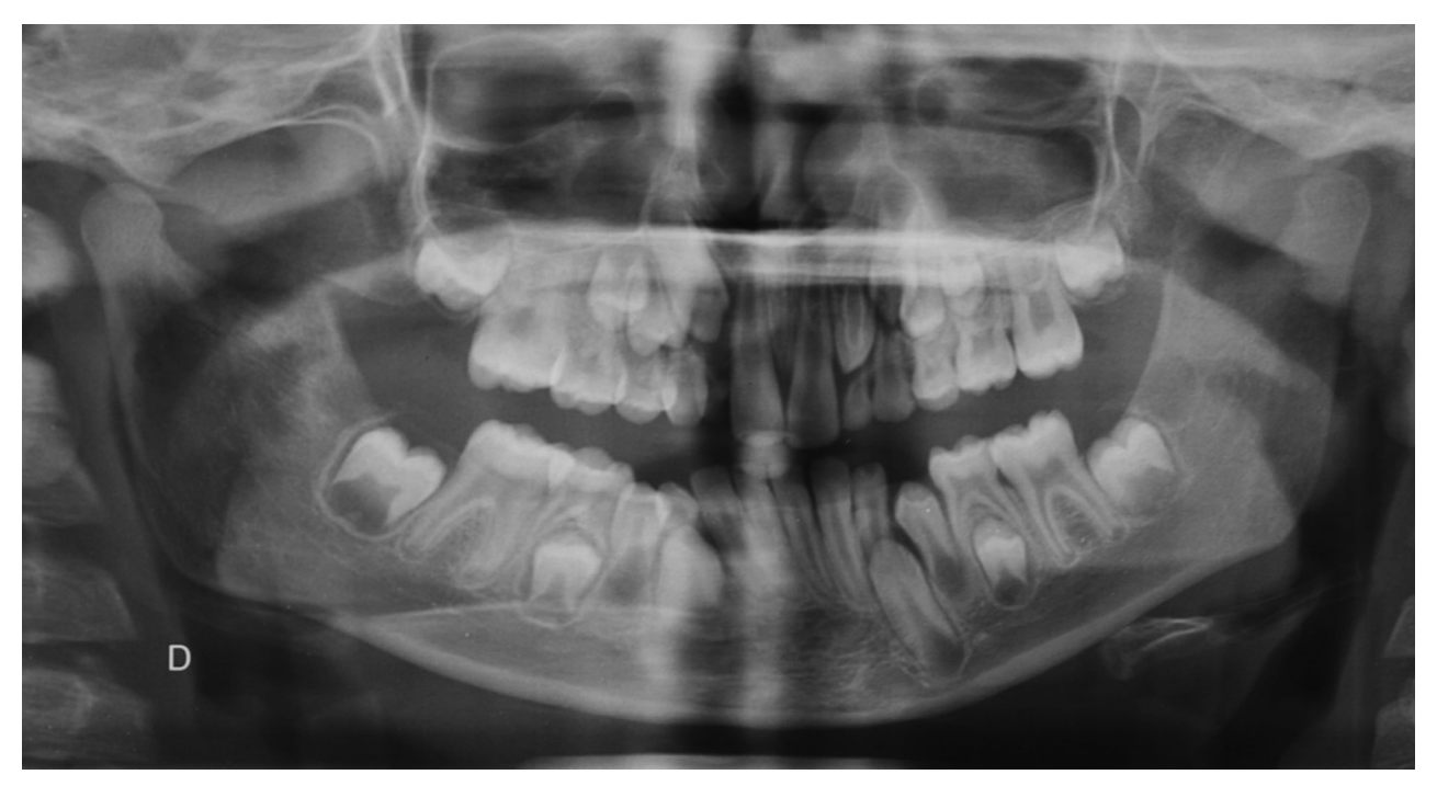
FIGURE 9. Orthopantomogram of case 3. Note agenesis of the upper right lateral incisor and right coronoid process dysplasia. Depeyre et al. Dento-Maxillofacial Signs in Aarskog Syndrome. J Oral Maxillofac Surg 2018.

Patients with ASS can present with several systemic (genital, hands, feet, skeletal, craniofacial, and others) manifestations. Short stature, shawl scrotum, cryptor-