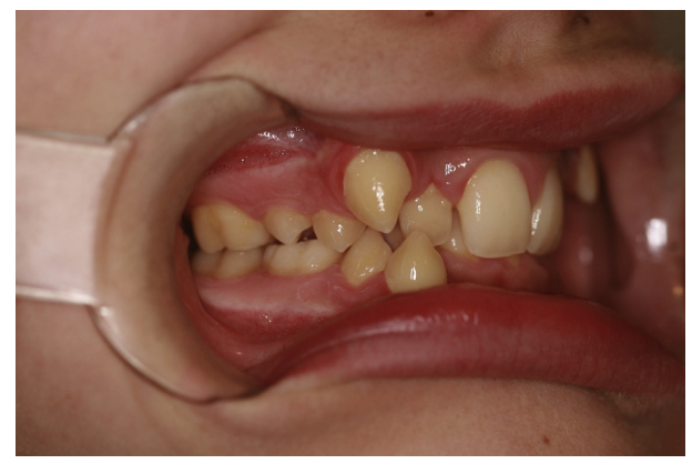
FIGURE 4. Dental occlusion image showing dental abnormalities and jaw discrepancy in case 1. Note buccally and inferiorly positioned maxillary canine teeth and delayed eruption of the maxillary left second premolar.

Three brothers, 9, 11, and 14 years old, were referred for screening of oral and maxillofacial