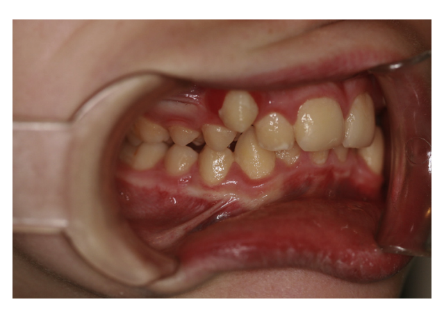
FIGURE 6. Dental occlusion image showing dental abnormalities and jaw discrepancy in case 2. Note buccally and inferiorly positioned maxillary canine teeth and delayed eruption of the second mandibular premolar teeth.

The first consultation concerned the oldest brother and was motivated by problems with dentofacial orthopedics and, more particularly, for a typical trans-