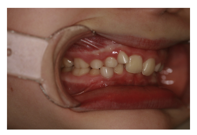
FIGURE 8. Dental occlusion image showing dental abnormalities and jaw discrepancy in case 3. Note marked vertical overbite and agenesis of the upper right lateral incisor.

In each patient, the extrafacial examination showed brachydactyly, joint hyperlaxity, and a single transverse palmar crease or "simian crease" (Figs 10 and 11). With respect to the genital malformation, they had a shawl scrotum represented by an upper scrotal skin rising over the base of the penis. Their cardiovascular system was entirely normal.