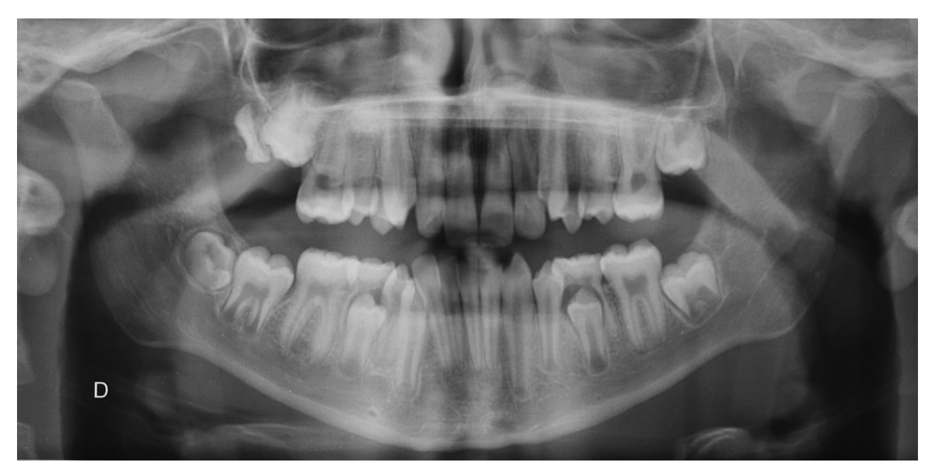
FIGURE 7. Orthopantomogram of case 2. Note agenesis of the left upper and lower third molars and a dystrophic right upper third molar. Depeyre et al. Dento-Maxillofacial Signs in Aarskog Syndrome. J Oral Maxillofac Surg 2018.

and a marked vertical overbite with the lower incisors in contact with the anterior palatal region. Agenesis of the upper right lateral incisor and right coronoid process dysplasia also were observed (Figs 8 and 9).