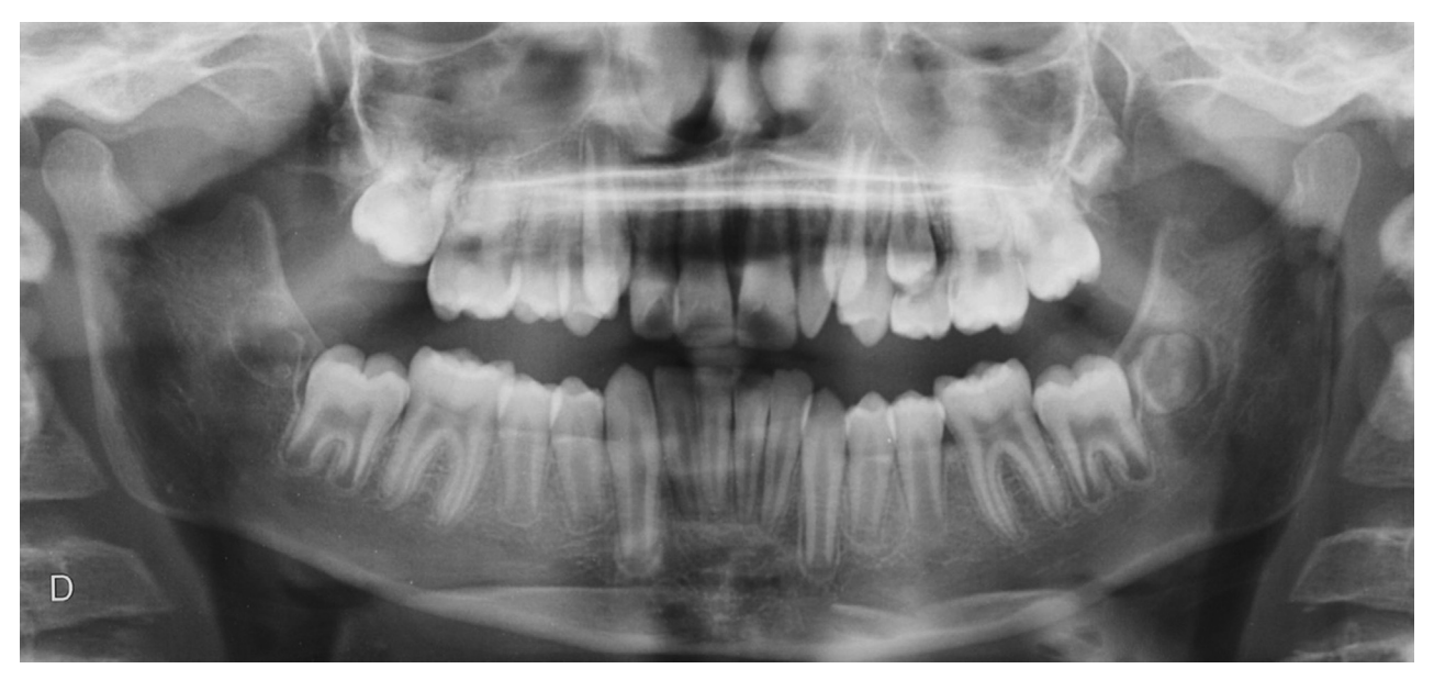
FIGURE 5. Orthopantomogram of case 1. Note delayed eruption of maxillary left second premolar.

Depeyre et al. Dento-Maxillofacial Signs in Aarskog Syndrome. J Oral Maxillofac Surg 2018.